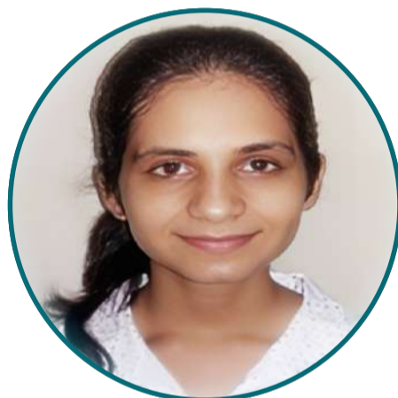
Ms. Sarita Birla Institute of Technology and Science, India